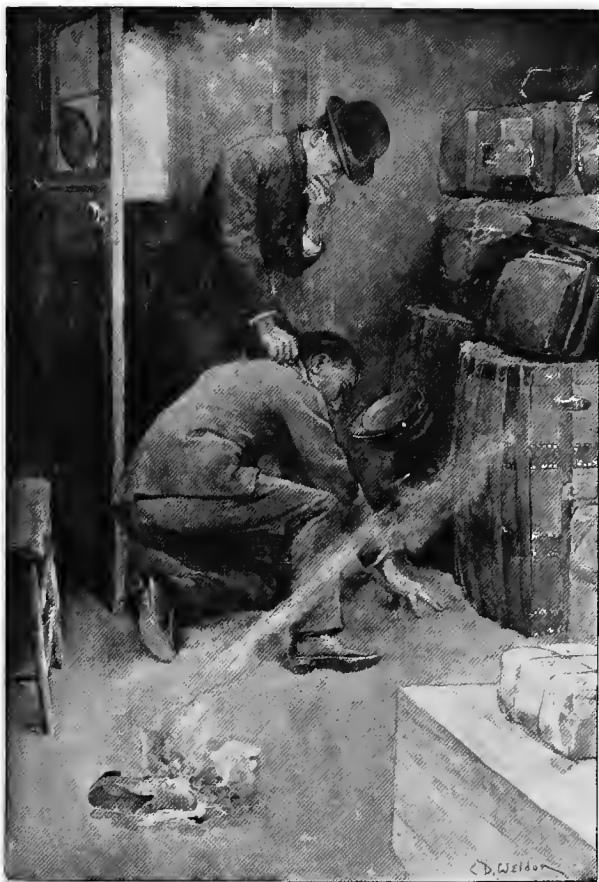
THESE GAVE IT A BETTER HOLD